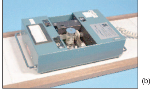
Figure 6 Sled-type tests (a) The FSC2000 (b) the Tortus test