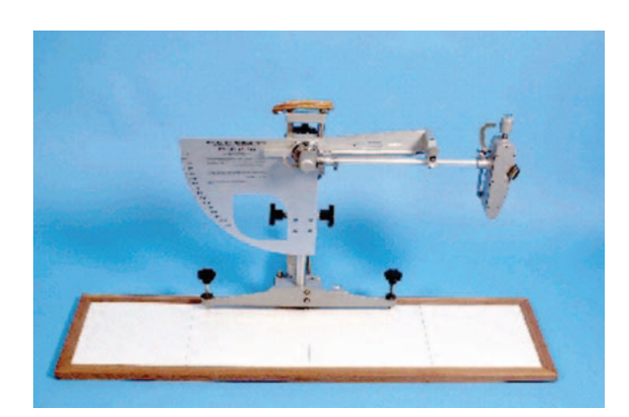
Figure 2 The pendulum CoF test

The pendulum CoF test (also known as the portable skid resistance tester, the British pendulum, and the TRRL pendulum, see Figure 2) is the subject of a British Standard, BS 7976: Parts 1-3, 2002.<sup>2</sup>