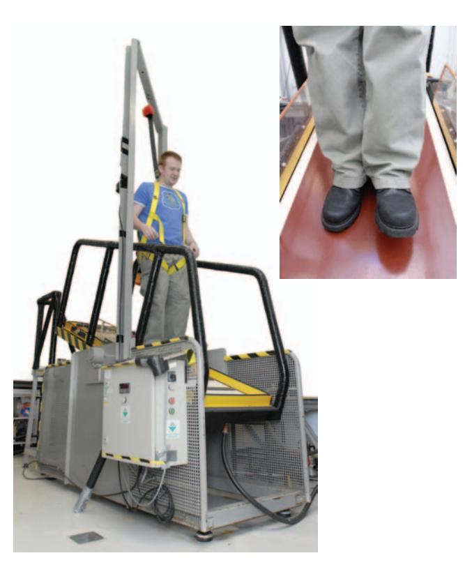
Figure 4 The UKSRG ramp CoF test

a contaminated flooring sample. The inclination of the sample is increased gradually until the test subject slips. The average angle of inclination at which slip occurs is used to calculate the CoF of the flooring. The CoF measured relates to the flooring used on a level surface. It is possible to assess bespoke combinations of footwear, flooring and contamination relating to specific environments using this method; HSL also use the ramp to assess the slipperiness of footwear.