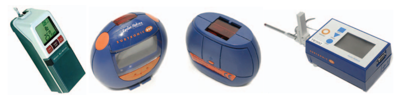
Figure 3 Surface microroughness meters (left to right: Mitutoyo Surftest SJ201P, Surtronic Duo, Surtronic 25)

The pendulum test equipment is large and heavy, so consider the manual handing of the equipment carefully for testing in the field.